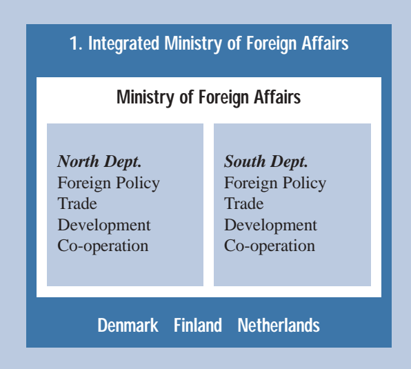
Figure 4. The five generic organisational models of DAC Member development co-operation agencies