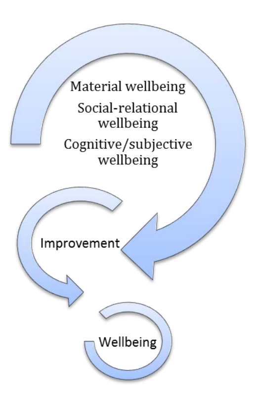
Figure 3 – The continuous improvement of wellbeing

Figure 3 represents the improvement of wellbeing (across all three of its dimensions) as the overall objective of economic decision making within an economics of wellbeing framework. Trying to improve wellbeing is a continuous process; the level ultimately achieved feeds back into the (future) wellbeing pursued and the conditions under which this is done. Instead of assuming that people have stable preferences over a particular set of material, socialrelational and or cognitive/subjective aspects of wellbeing, we postulate that people are able to express relative priorities vis à vis one aspect or the other (e.g. M may be prioritised over C, M over R, C over M, C over R, R over M, or R over C) a combination of a particular kind (M \cap C, M \cap R) , or C \cap R , or the totality of all (M \cap C \cap R) - see the Venn diagram in Figure 2 from which the alternative solutions are derived. By studying the intersection of wellbeing dimensions in the above manner, we do more justice to the complexity and dynamics of economic decisions that are made in multiple dimensions of wellbeing at the same time, and may adjust constantly depending on what has been achieved or not in another dimension. So, where we recognise that there are three dimensions to each economic decision that we make, we do recognise that people may prioritise one over the other for different reasons and varying over time.