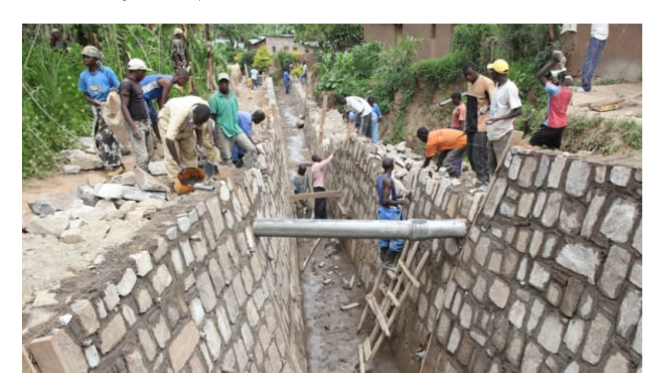
A construction of a water tunnel, supported by UN-Habitat and ONE UN in Bugesera, Rwanda.

The government of Cameroon, UN-Habitat and other stakeholders began formulating and implementing the Cameroonian National Urban Policy in Feb. 2016. The policy will be an instrument for applying a coherent set of decisions in relation to the future of urban areas in Cameroon, drawing upon a process of consultation and coordination among different actors. It will also help the government revise planning tools, improve the implementation of the planning rules and regulations, increase the sources of financing and optimization of public infrastructure, and strengthen the capacities of the stakeholders both at the national and subnational levels.