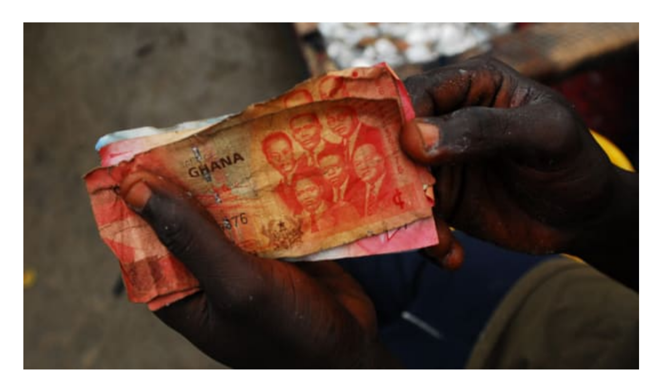
A fisher in a local market in Jamestown, Accra is counting Ghanaian cedis.

• The third covers the complementary services provided by the welfare state, mainly safety and security, education, health, public housing, local economy promotion, and cultural services. The role and capacity of local governments to guarantee these services largely depends on the delegation of such authority by the national government.