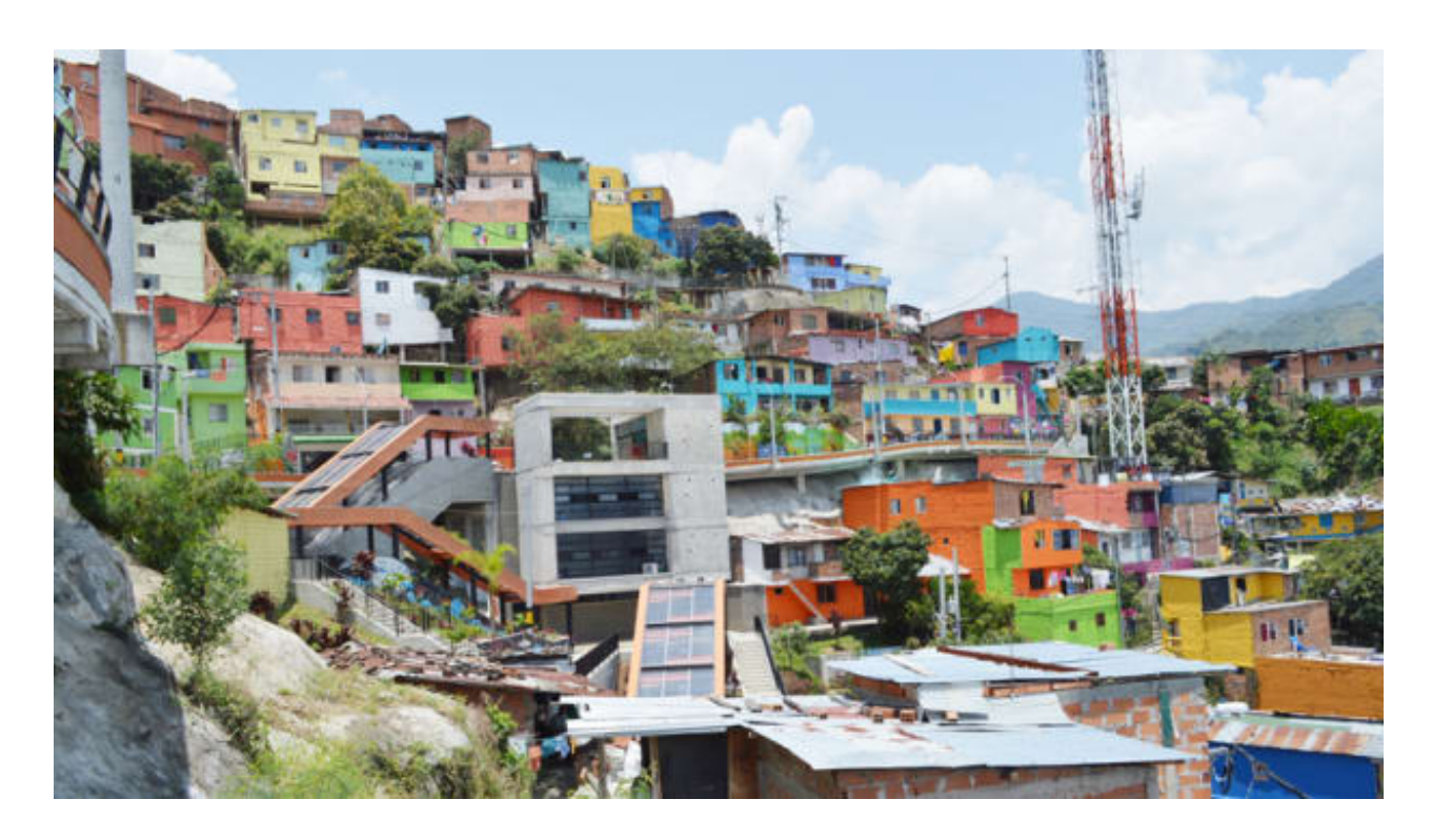
Escolaras de comuna 13 take residents up into a hillside community in Medellin, Colombia.

With a peri-urban structure and a population that is projected to grow by half a million people annually over the coming years, Kenya's Kiambu County needs to acquire budgetary resources to quickly upgrade and build public infrastructures.