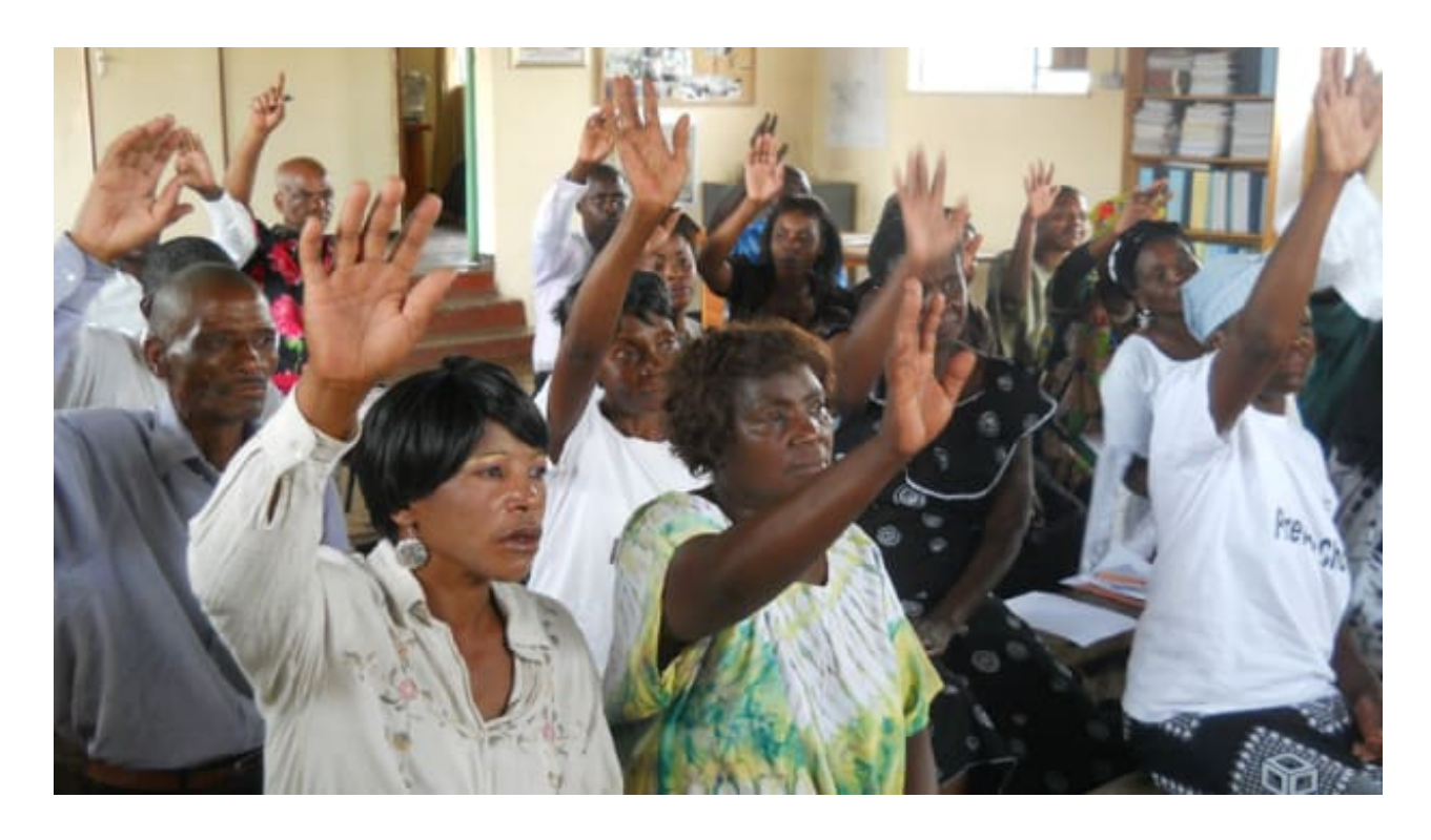
Community consultation in Kanyama, Zambia.

To combat this, the government of the Republic of Zambia recently enacted the Urban and Regional Planning Act, the principal legislation for urban land use planning. It aims to fundamentally transform the land use planning system, planning frameworks and planning process.